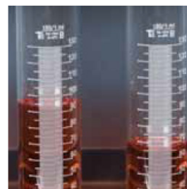
injection volume metering